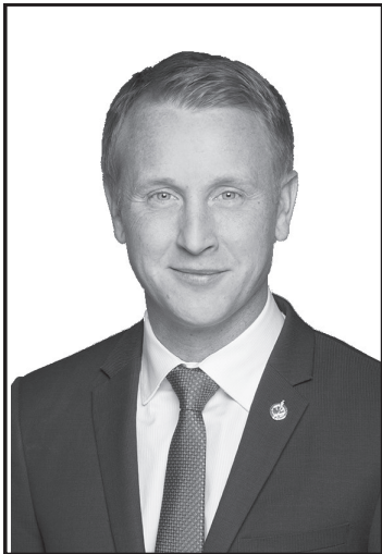
Chris Warkentin, MP